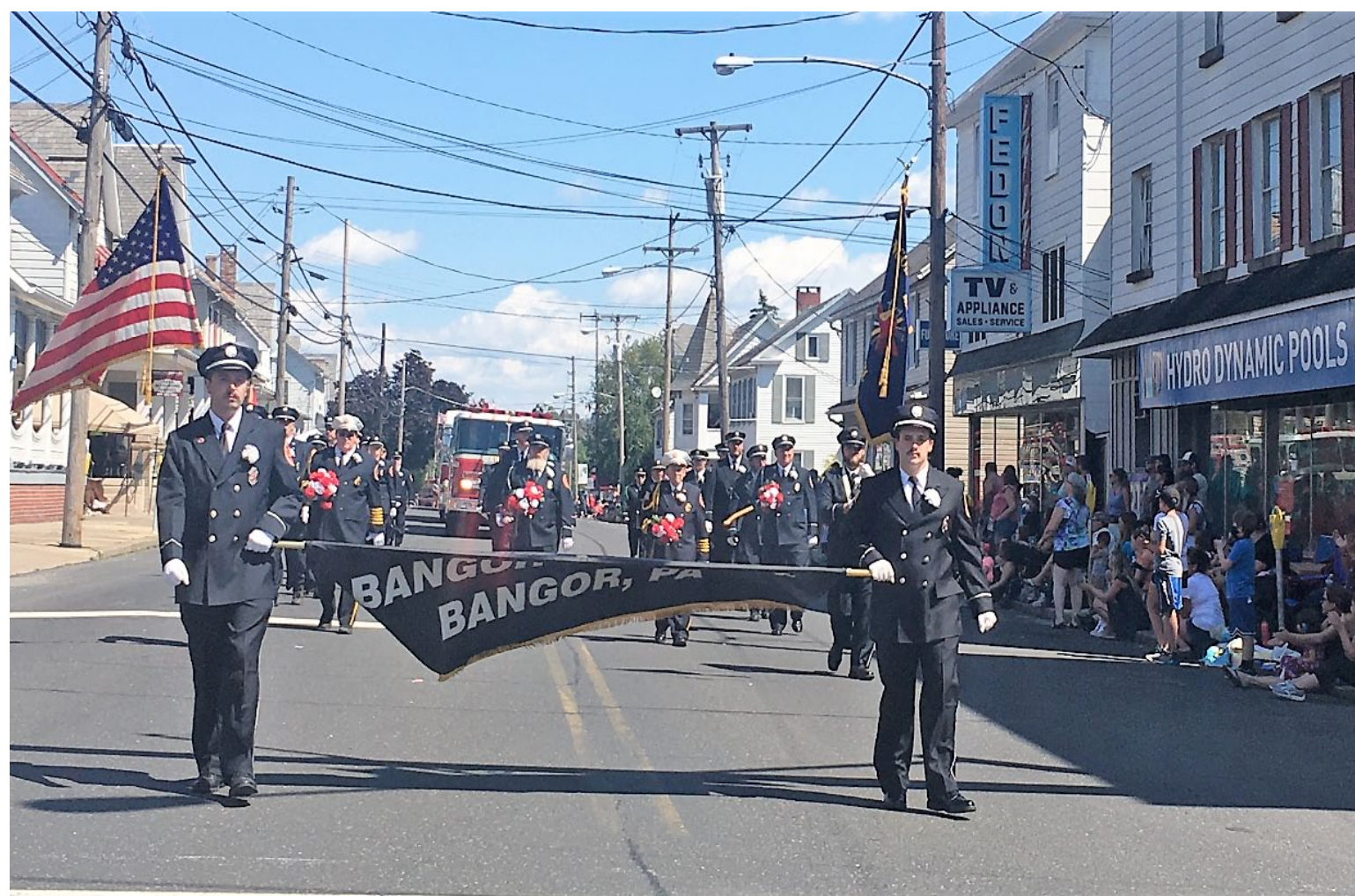
(Above) the award winning Lookout Fire Co. proudly display their plaques. (Below) the Bangor Fire Company parades west on Pennsylvania Ave. (Rt 512) PHOTO GALLERY - 70 PICS

Ticket Mailing Sponsorships 610.588.1000