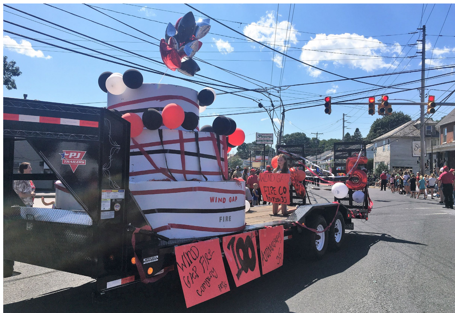
Washington Twp and Wind Gap fire companies participated in the Pen Argyl Labor Parade. PHOTO GALLERY - 70 PICS