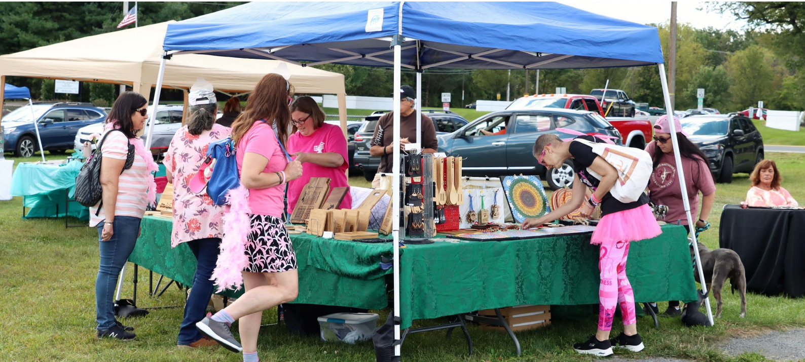
This is one of many vendors at the car, truck and vendor show sponsored by Awareness 365 Sunday at the Blue Valley Farm Show in the fight against breast cancer. PHOTO GALLERY