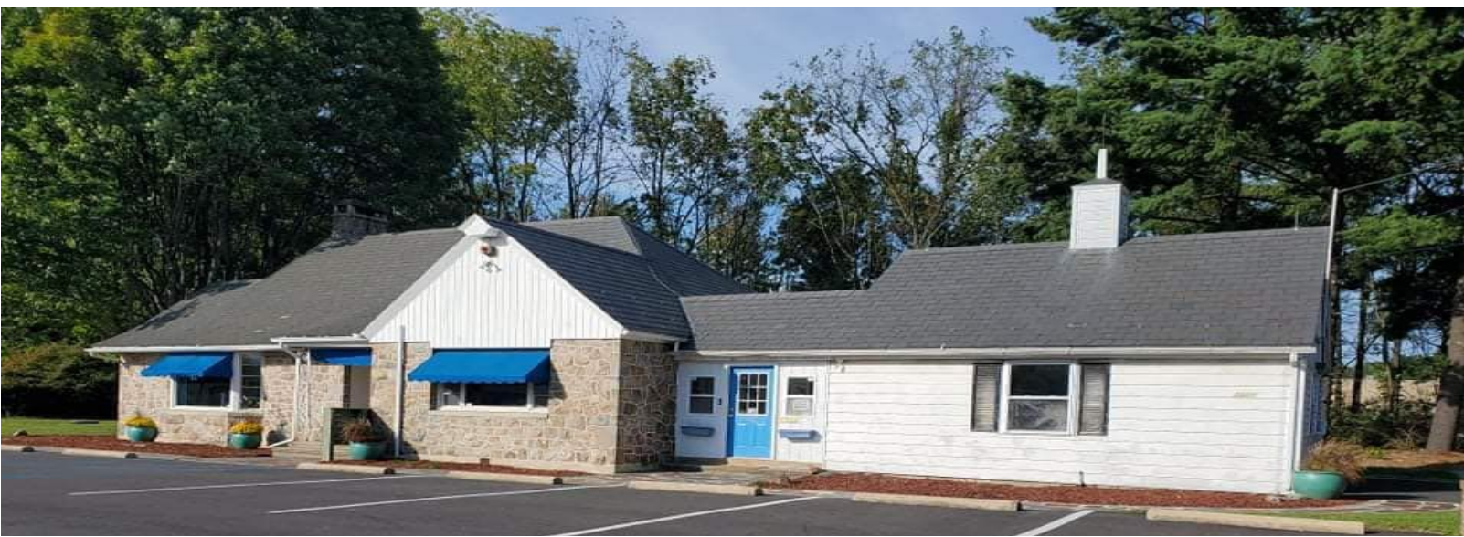
Rush Registration Vehicle Tags & Notary has moved just across the street to 1405 Blue Valley Dr. with plenty of free parking. Rush thanks everyone for their years of patronage and apologizes any inconvenience.