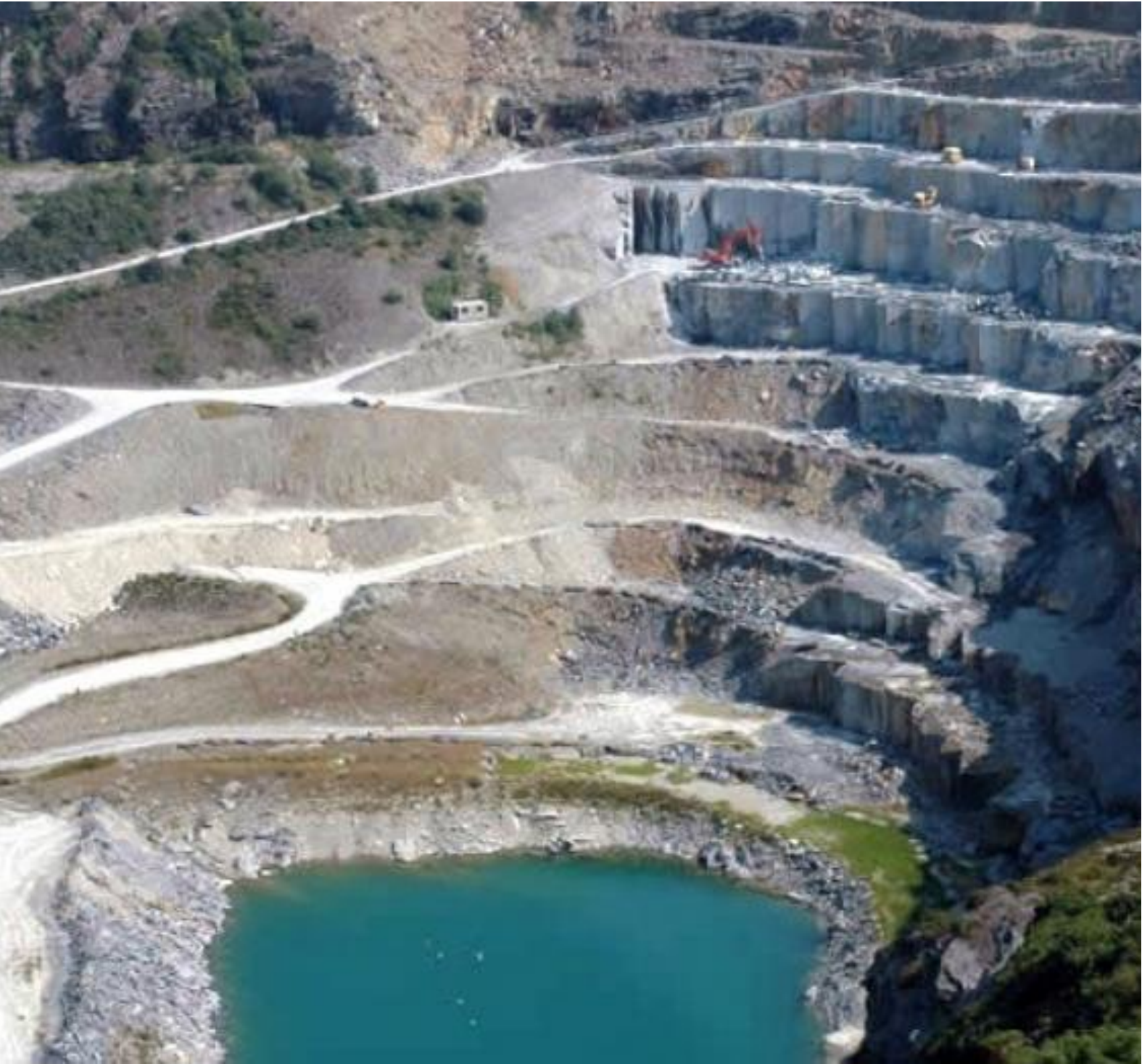
The village of Delabole in the Slate Belt takes its name from Delabole in Cornwall, UK. Above is photo of a slate quarry in Delabole, UK.