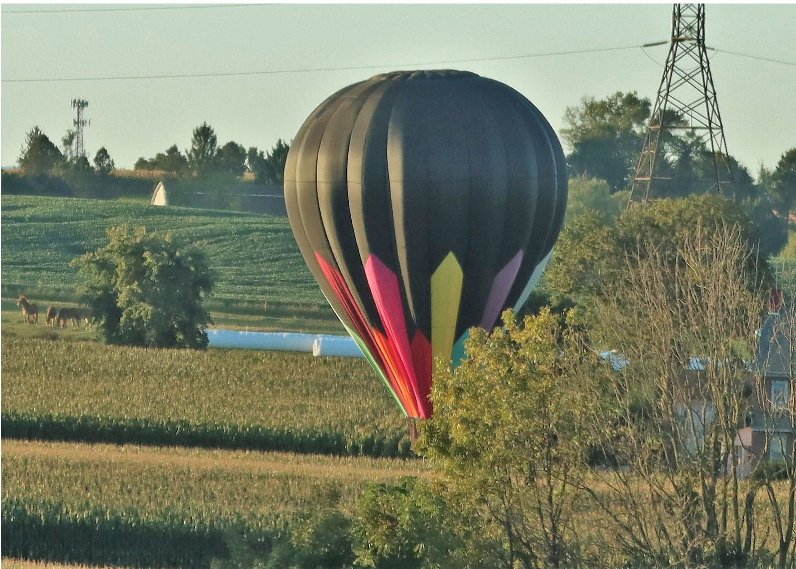
This was a hot air balloon that landed in a field during hot air balloon festival last weekend in Ronks, PA.