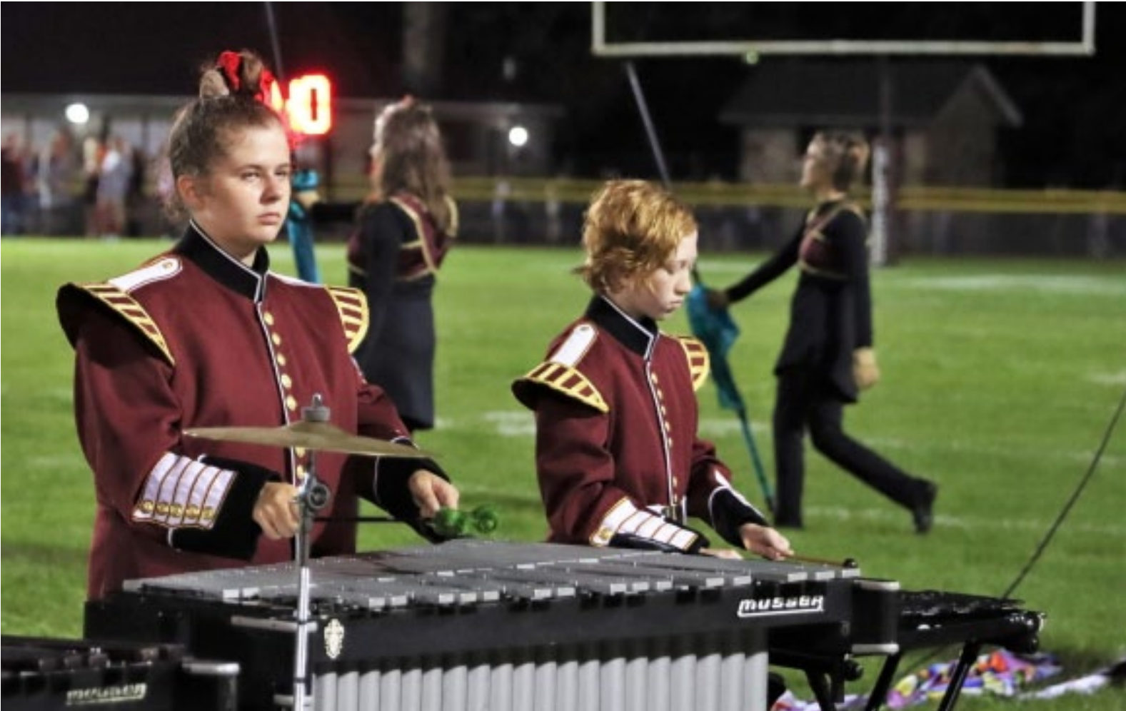
The Slater Band Festival will be held 6:pm Saturday at Bangor Memorial Park.