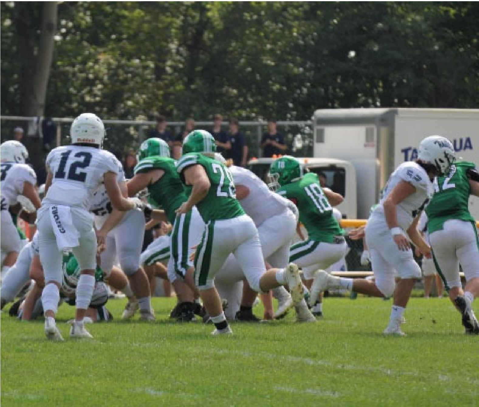
Pen Argyl’s defenders run to the ball Green Knights during a 34-14 loss to Tamaqua in a game played at Pen Argyl Saturday.