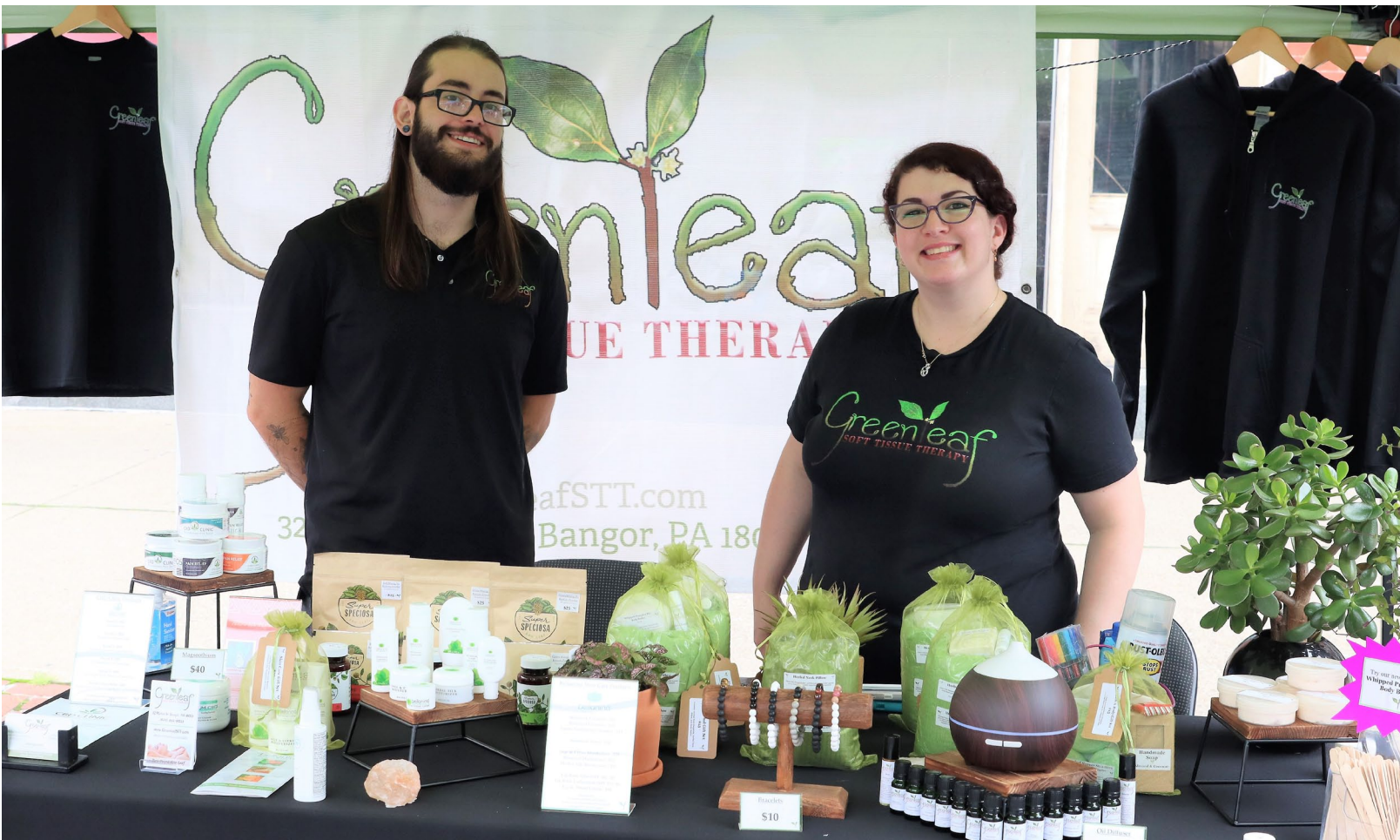
Greenleaf Soft Tissue Therapy, 32 Market Street, Bangor was one of several vendors at the Bangor Plant Festival held in downtown Bangor Sunday. PHOTO GALLERY

Awards: First Place Overall Male & Female, Top 3 Male & Female by Age Group: 11 & under, 12-19, 20-29, 30-39, 40-49, 50-59, 60 & up