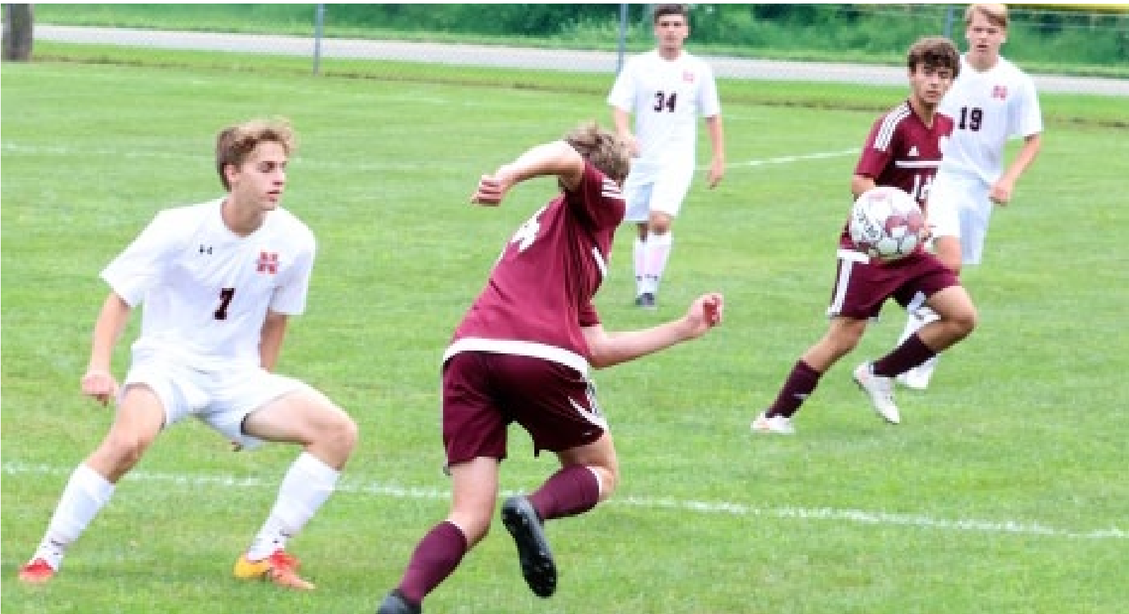
Bangor scrimmaged Northampton Tuesday. (Names unavailable) PHOTO GALLERY