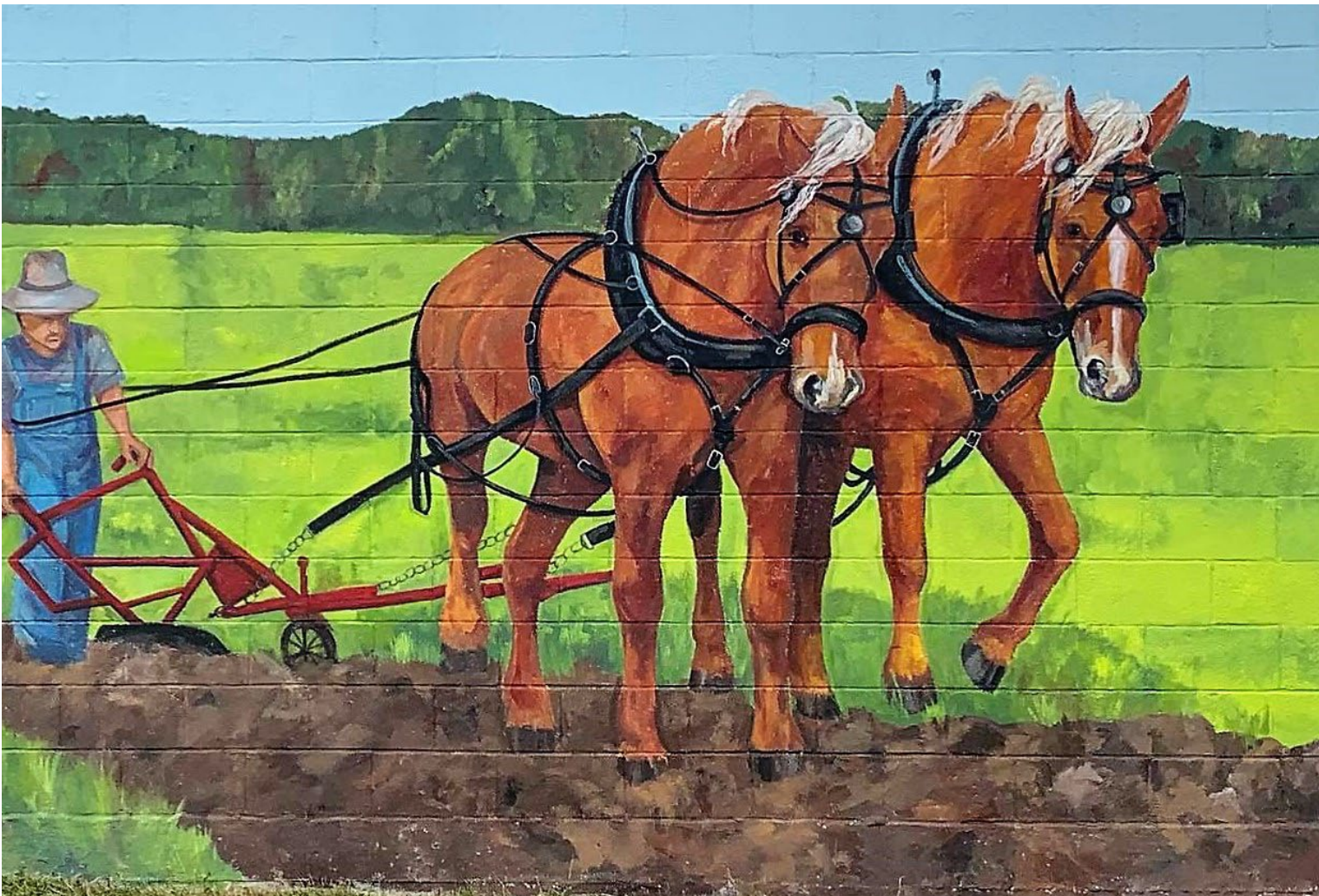
Teri Palmer's latest mural is a continuation of the Blue Valley Farm Show Mural she painted this summer. The latest mural is just around the corner from the first one.

Please call the Plainfield Township Municipal Office (610-759-6944) with any questions.