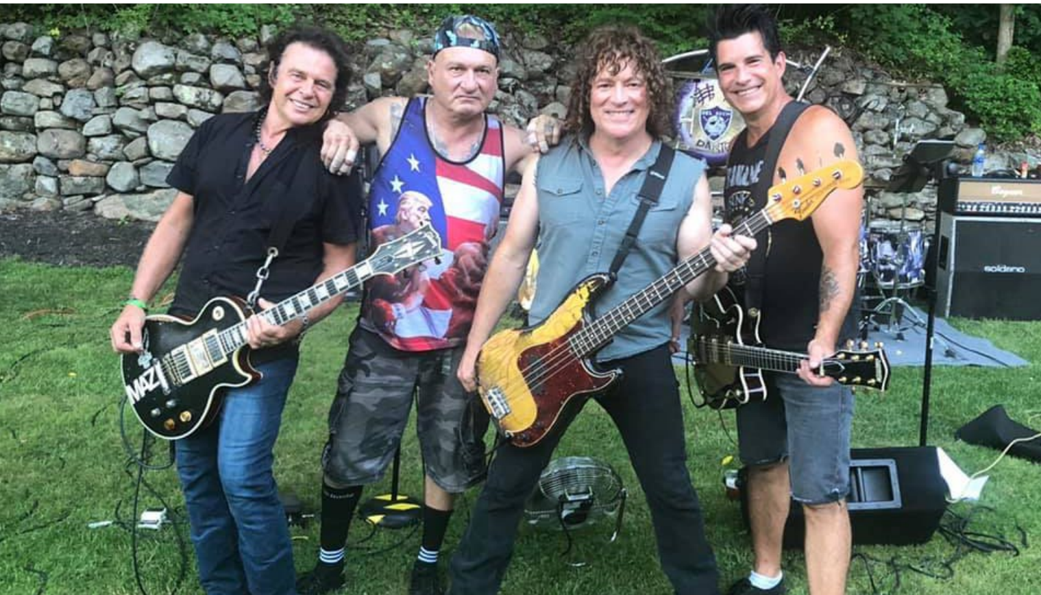
The Off The Road band will play at Murray Street Courtyard in Bangor Sunday starting at 3:00pm.