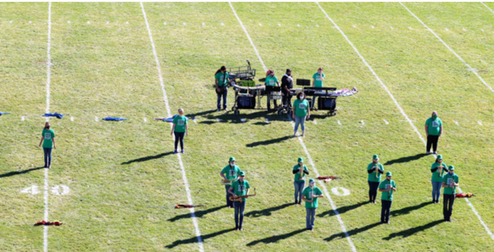
The Pen Argyl High School Band performed at halftime of the Pen Argyl - Northern Lehigh Game. PHOTO GALLERY