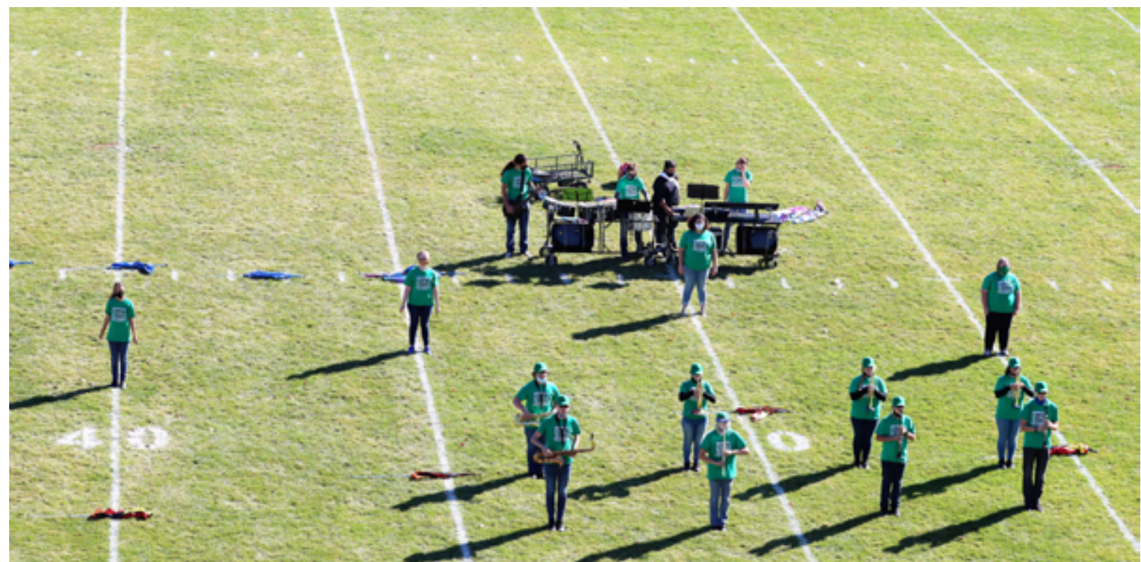
The Pen Argyl High School Band performed at halftime of the Pen Argyl - Northern Lehigh Game. PHOTO GALLERY

Hometown BRAND CENTER APPLIANCE SALES, SERVICE & SUPPORT