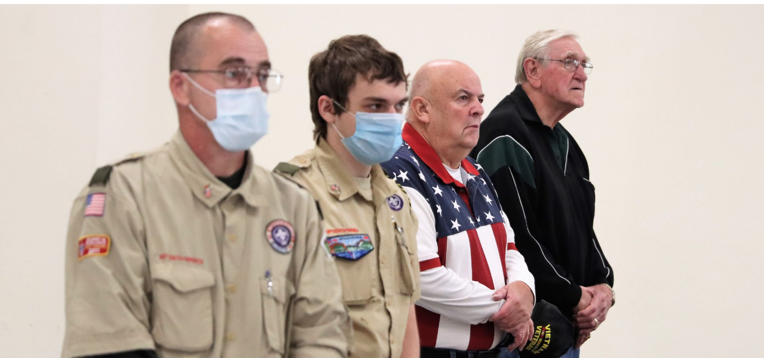
(Above) The Civil Air Patrol Color Guard enters VFW Post 739 for a Veterans Day program. (Below) Boy Scout representatives and Veterans watch the proceedings. PHOTO GALLERY