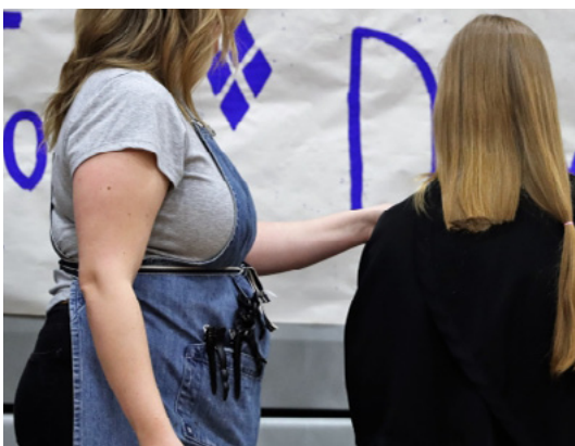
BAHS Mini Thon