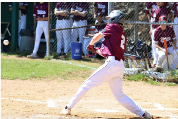
Bangor - Pen Argyl Baseball