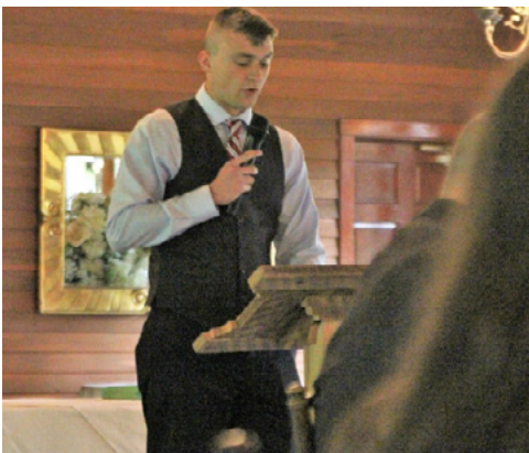
PAHS Honor Society