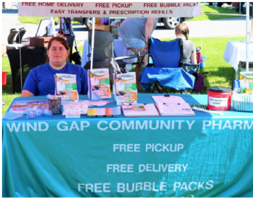
Sizzling Summer Vendor