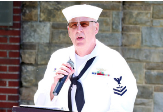
West Bangor Memorial Day