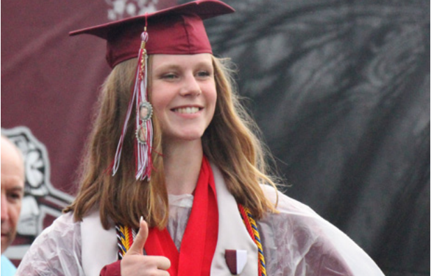
Bangor Graduation - 2