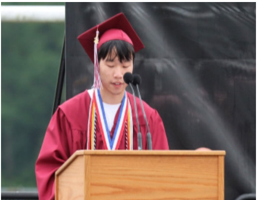
Bangor Graduation - 1