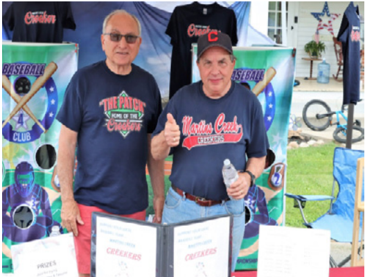
LMBT Community Day