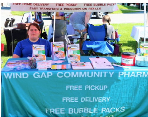
Sizzling Summer Vendor