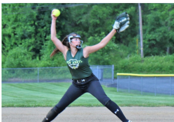
Pen Argyl - UMBT Softball