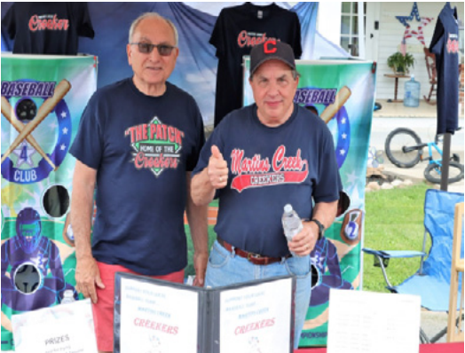
LMBT Community Day