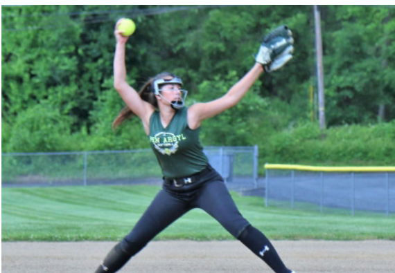
Pen Argyl - UMBT Softball