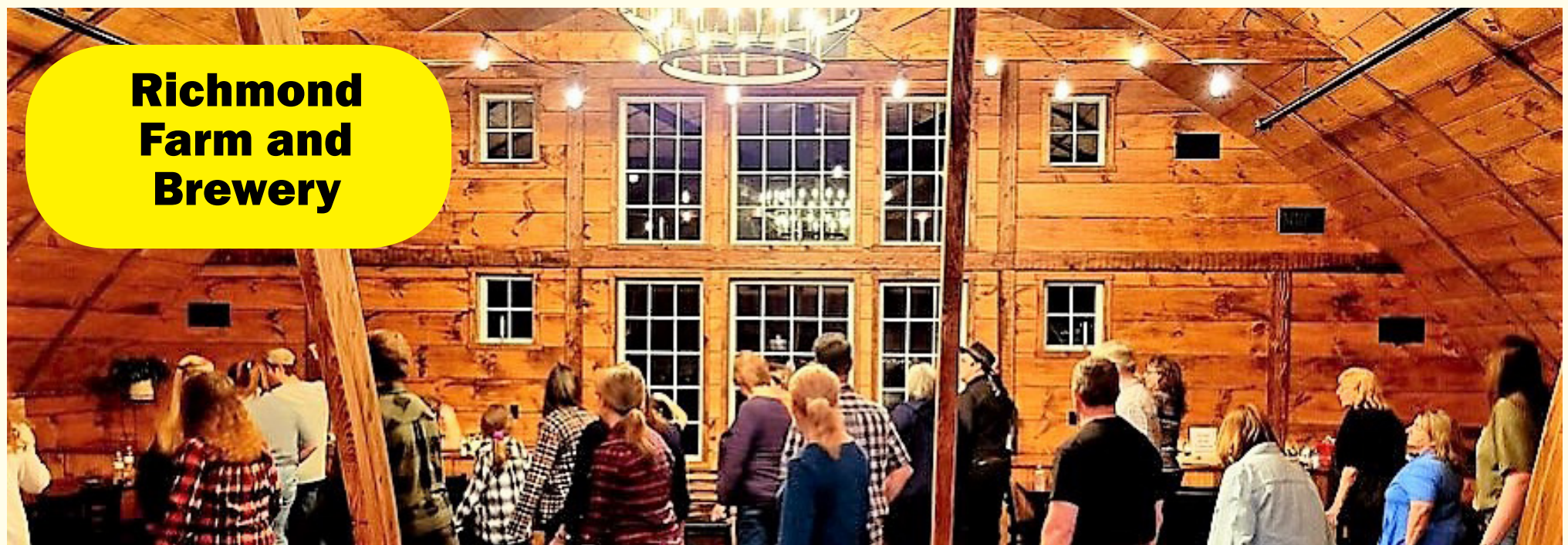
Richmond Farm and Brewery