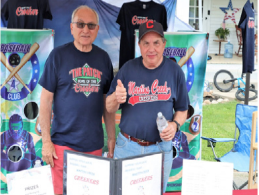
LMBT Community Day