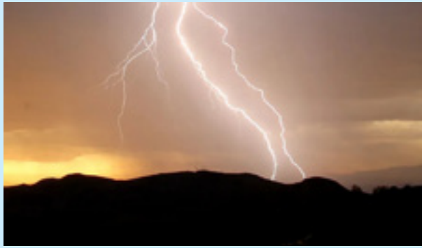
Slate Belt 7-Day Forecast