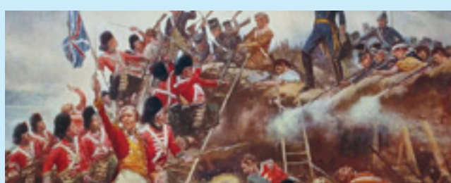
This Day In History