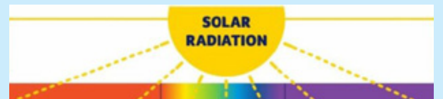
Ultra Violet Rays