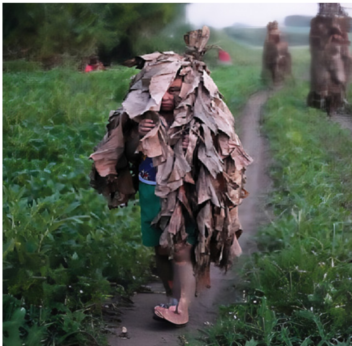
A devout Catholic, dressed in dried banana leaves, participates in a Mass at the church of Saint John the Baptist in Philippines.