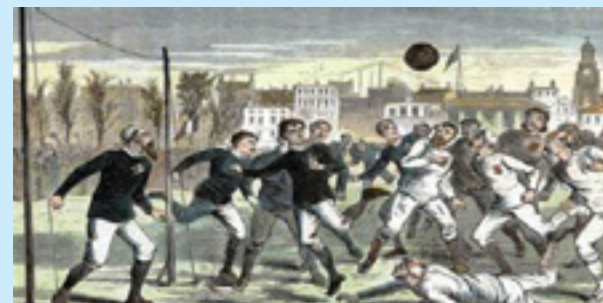
Sports History Today