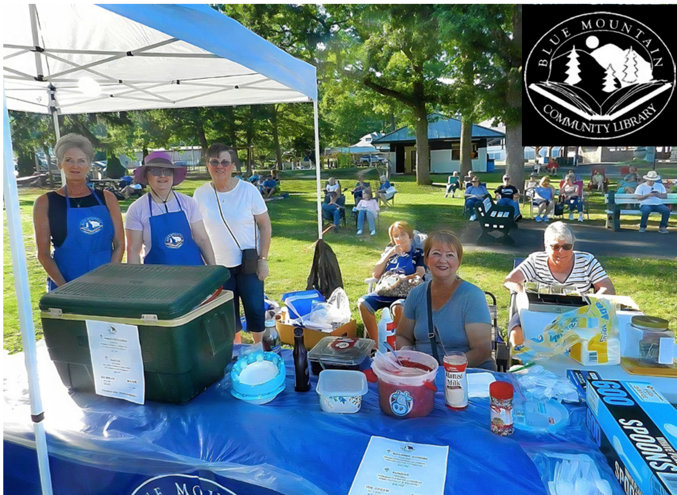
Members of the Blue Mt. Community Library Board sold sundaes at the “Philadelphia Funk” Weona Park Summer Sounds Concert on June 16. They will be back on June 30 for “Joyous.”