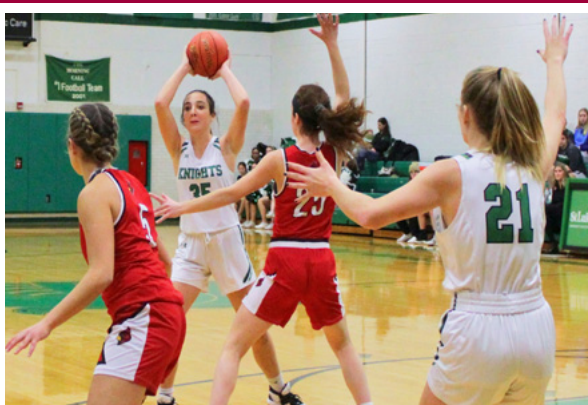
Pen Argyl - PME Girls