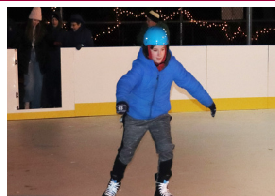
Roseto Ice Rink