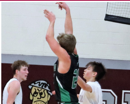
Bangor - PA Boys