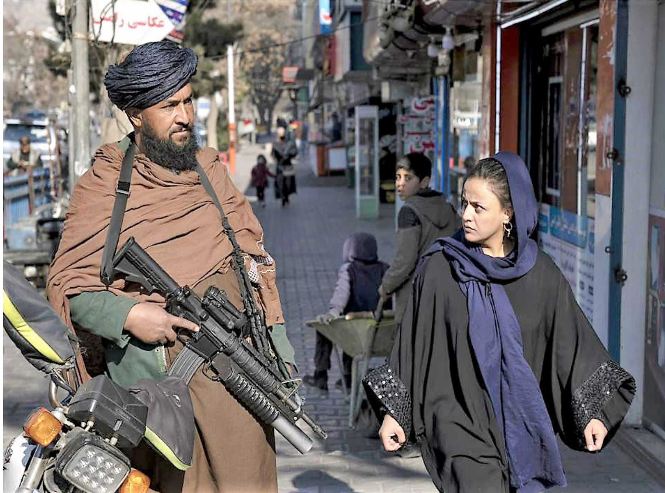
A Taliban fighter stands guard as a woman walks past in Kabul, Afghanistan, last week. Recent Taliban rulings on Afghan women include bans on university education and working for NGOs. Security in the capital Kabul has intensified in recent days, with more checkpoints, armed vehicles, and Taliban special forces on the streets.