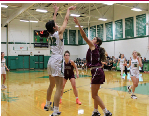
Bangor - PA Girls