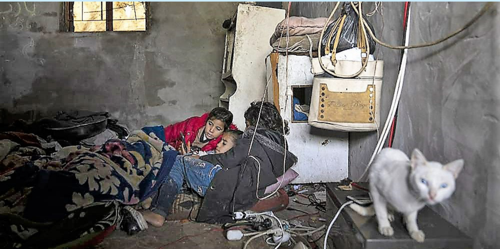
Palestinian girls play inside their house, bundled up to keep warm from the cold weather, recently on the outskirts of the Khan Younis refugee camp, southern Gaza Strip.