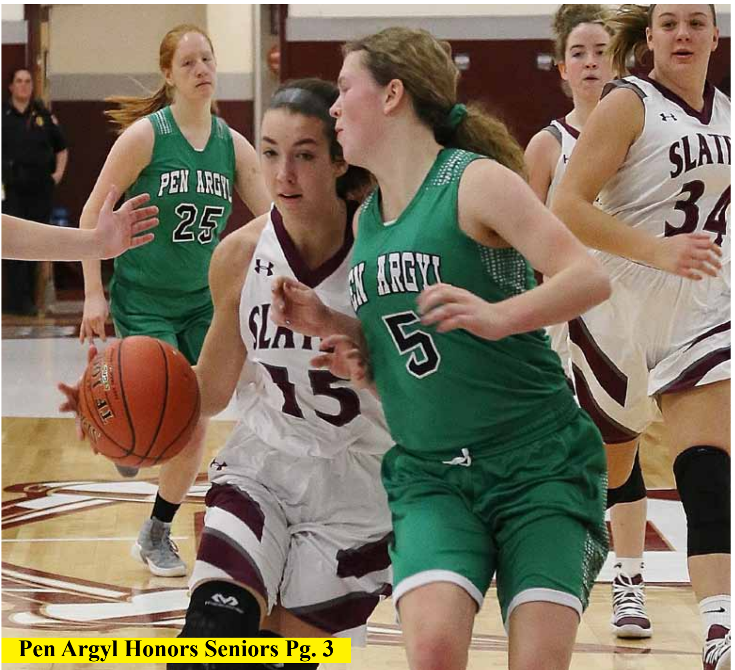
Pen Argyl Honors Seniors Pg. 3

BANGOR & PEN ARGYL NEWS JANUARY 19, 2019