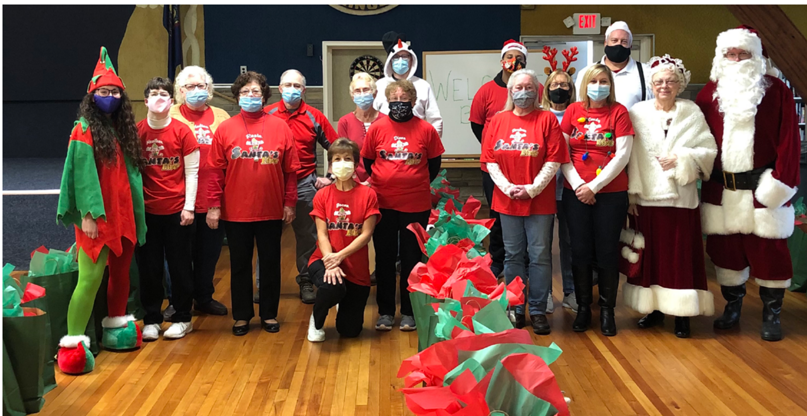
Slate Belt Chamber of Commerce Santa's Elves Committee members.