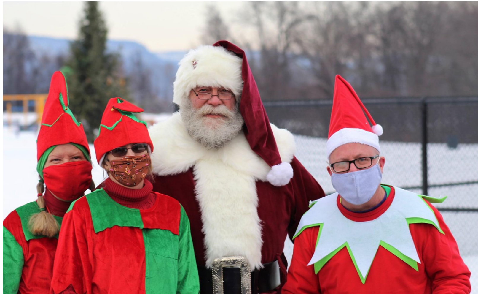
Christmas at UMBT Park.