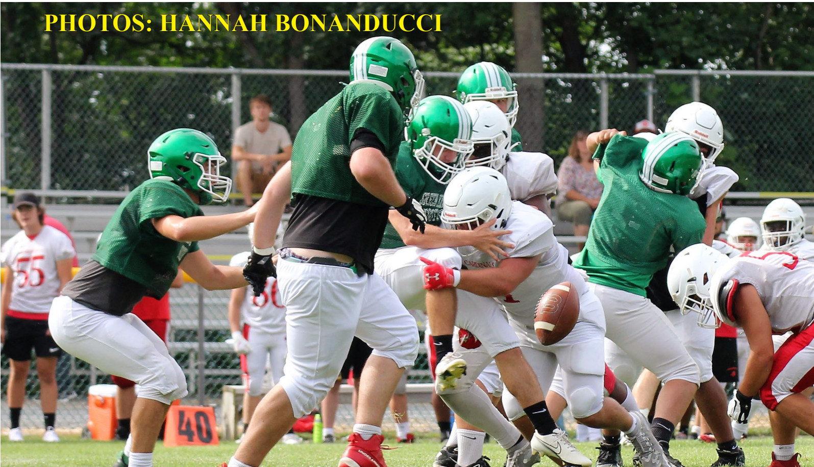
Pen Argyl scrimmaged Pocono Mountain West Saturday at PAHS. PHOTO GALLERY