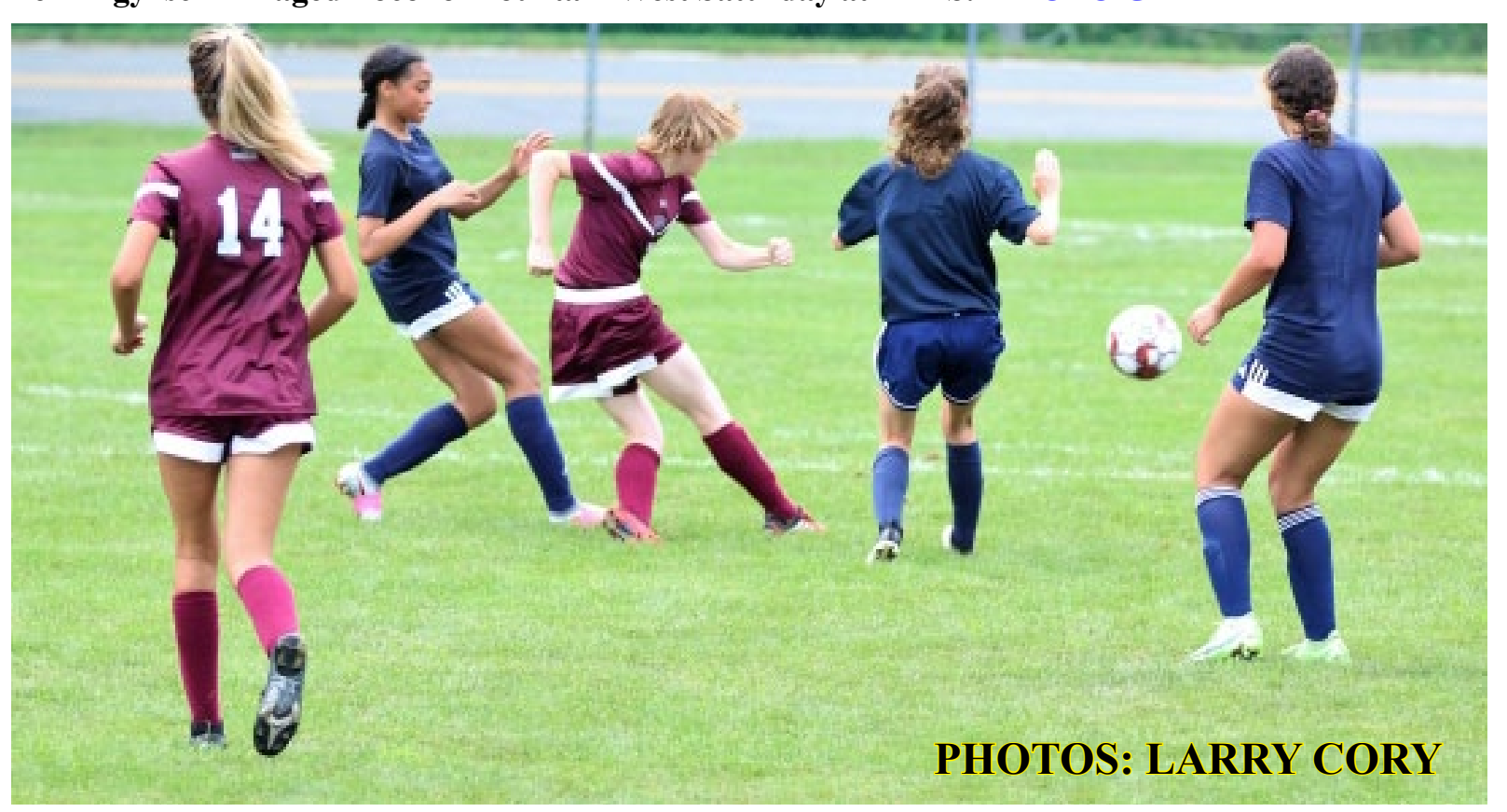
Bangor scrimmaged Pocono Mountain East Saturday at BAMS. PHOTO GALLERY