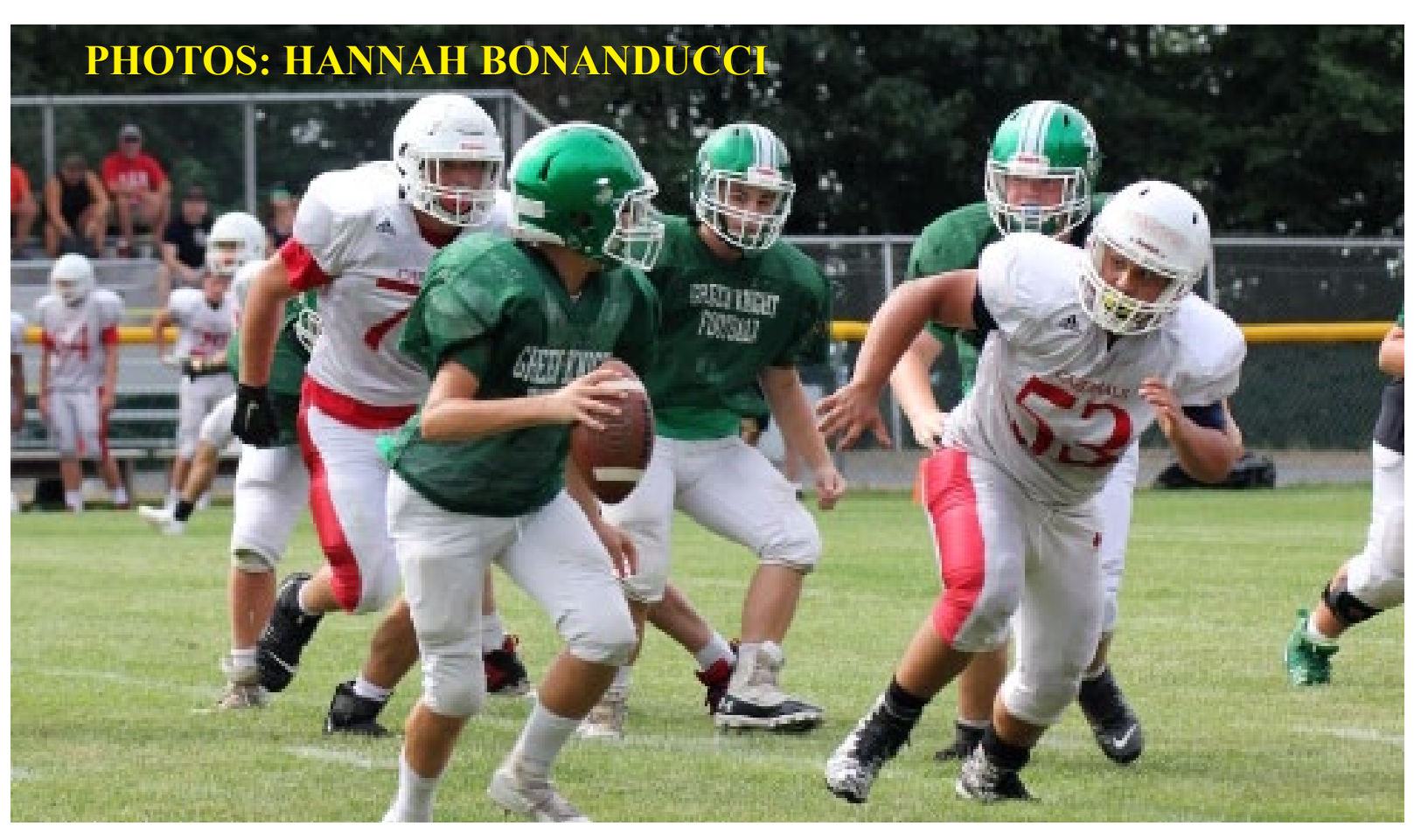
Pen Argyl scrimmaged Pocono Mountain West Saturday at PAHS. PHOTO GALLERY