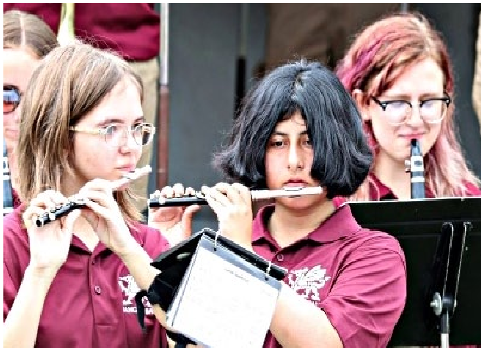
The Bangor High School Marching Band made its annual appearance at the Blue Valley Farm Show Saturday afternoon. PHOTO GALLERY.