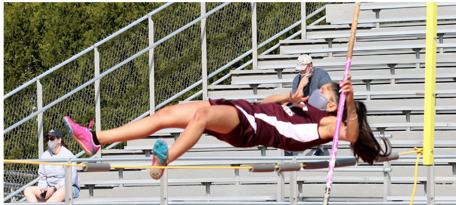
The Bangor Boys and Girls Track teams competed in a meet held at Paul Farnan Field in Bangor Memorial Park Tuesday afternoon.